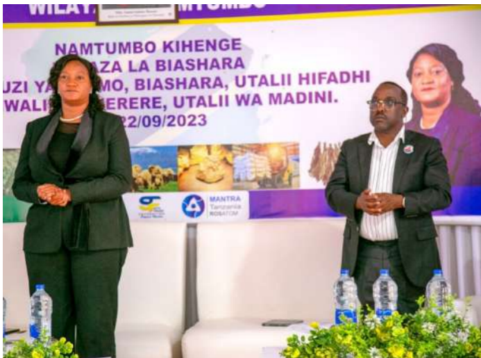
The Namtumbo District Commissioner, Hon. Ngollo Ng'waniduhu Malenya (Left), and the Member of Parliament of Namtumbo constituency, Hon. Vita Rashidi Kawawa (Right) attending the Namtumbo Kihenge forum in 2023.