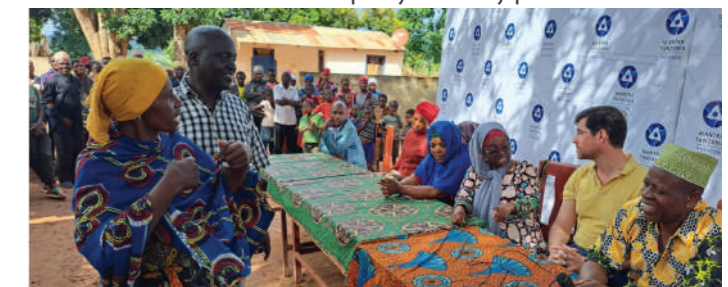
Community member shares thoughts on Mantra Tanzania's corporate social responsibility efforts during the meeting with villagers in Likuyu ward on April 6, 2023.

As for partnership with local communities, training on how to stay safe around the uranium mine was held. This training has covered topics such as the health effects of uranium exposure, how to identify and avoid uranium hazards, and what to do in the event of an accident. Work is also continuing to raise awareness of uranium in the community. This has included providing information about the health effects of uranium exposure, as well as information about the company's safety procedures.