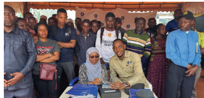
Mantra staff proudly holding a crystal award they received for their support of the 2023 Namtumbo Kihenge Forum. This award is a testament to the ongoing commitment that the company has to the Namtumbo community and its efforts to promote development in the region.