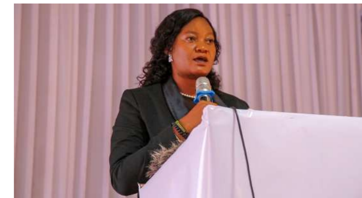
The Hon. Ngollo Malenya, Namtumbo District Commissioner, addressing the Namtumbo Business Forum to promote investment opportunities in the district.

Mantra recently organized a mining tour for 150 people from the Namtumbo business forum, led by the Namtumbo DC. The tour aimed to educate people on the operations of uranium mining and showcase the safety precautions taken by Mantra during its operations. The tour took place at Mantra's uranium mining site located within the Nyerere National Park, which is approximately 54km away from the residents' houses and about 140km away from the Namtumbo Center.