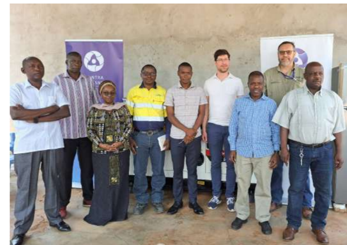
Mantra's and Park Staffs Group photo during Generator handing over.